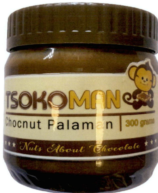
Figure 1. Unregistered TSOKOMAN Chocnut Palaman

The Food and Drug Administration (FDA) warns all healthcare professionals and the general public NOT TO PURCHASE AND CONSUME the unregistered food product: