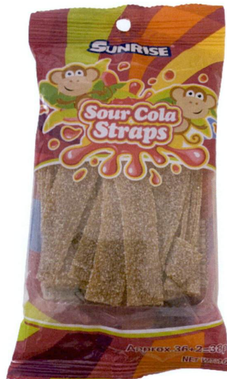
Figure 1. Unregistered SUNRISE Sour Cola Straps

The Food and Drug Administration (FDA) warns all healthcare professionals and the general public NOT TO PURCHASE AND CONSUME the unregistered food product: