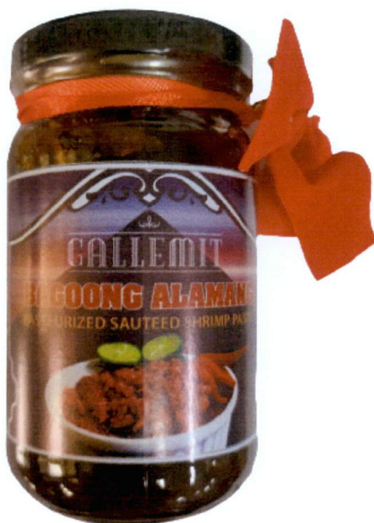
Figure 1. Unregistered GALLEMIT Bagoong Alamang Pasteurized Sautéed Shrimp Paste

The Food and Drug Administration (FDA) warns all healthcare professionals and the general public NOT TO PURCHASE AND CONSUME the unregistered food product: