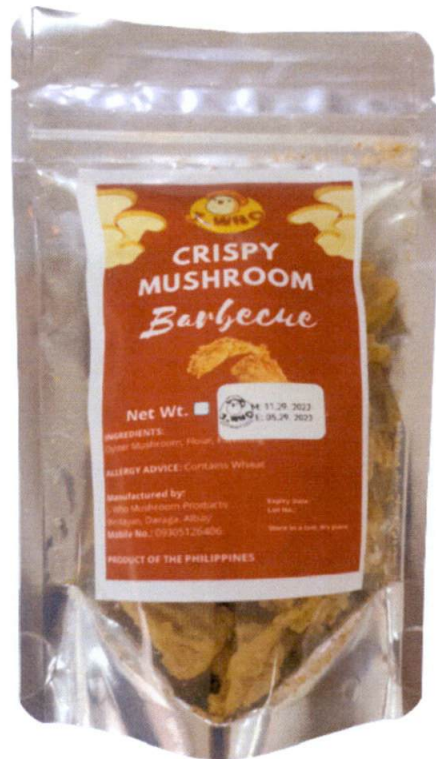
Figure 1. Unregistered J. WHO Crispy Mushroom Barbecue

The Food and Drug Administration (FDA) warns all healthcare professionals and the general public NOT TO PURCHASE AND CONSUME the unregistered food product: