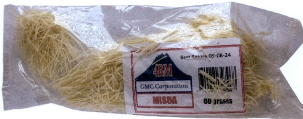
Figure 1. Unregistered 4RM Misua

The Food and Drug Administration (FDA) warns all healthcare professionals and the general public NOT TO PURCHASE AND CONSUME the unregistered food product: