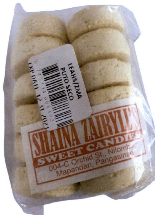
Figure 1. Unregistered SHAINA ZAIRYLL'S SWEET CANDIES Puto Seco

The Food and Drug Administration (FDA) warns all healthcare professionals and the general public NOT TO PURCHASE AND CONSUME the unregistered food product: