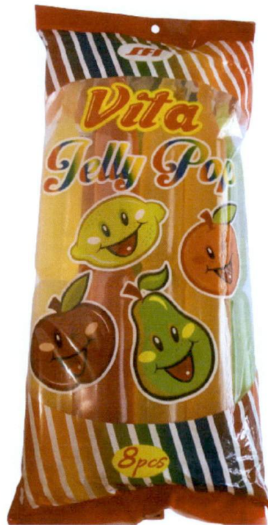
Figure 1. Unregistered SFI VITA Jelly Pop

The Food and Drug Administration (FDA) warns all healthcare professionals and the general public NOT TO PURCHASE AND CONSUME the unregistered food product: