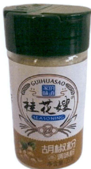
Figure 1. Unregistered GUIHUASAO Seasoning (in Foreign Language)

The Food and Drug Administration (FDA) warns all healthcare professionals and the general public NOT TO PURCHASE AND CONSUME the unregistered food product: