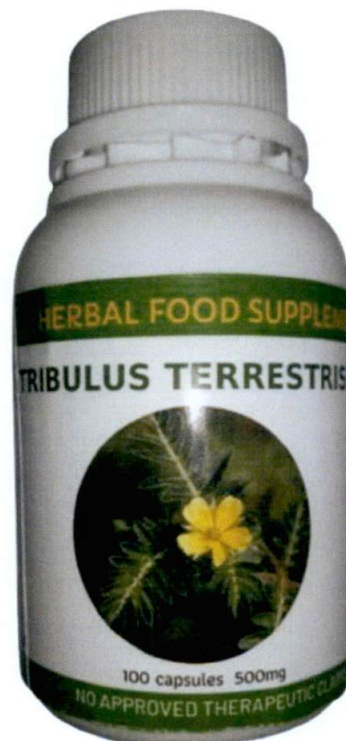
Figure 1. Unregistered UNBRANDED Tribulus Terrestris Herbal Food Supplement

The Food and Drug Administration (FDA) warns all healthcare professionals and the general public NOT TO PURCHASE AND CONSUME the unregistered food supplement: