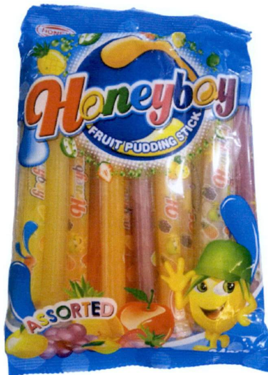
Figure 1. Unregistered HONEY Honeyboy Fruit Pudding Stick Assorted

The Food and Drug Administration (FDA) warns all healthcare professionals and the general public NOT TO PURCHASE AND CONSUME the unregistered food product: