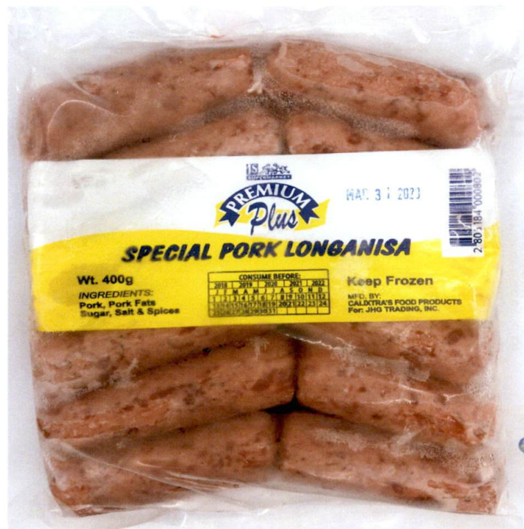
Figure 1. Unregistered JS SUPERMARKET Premium Plus Special Pork Longganisa

The Food and Drug Administration (FDA) warns all healthcare professionals and the general public NOT TO PURCHASE AND CONSUME the unregistered food product: