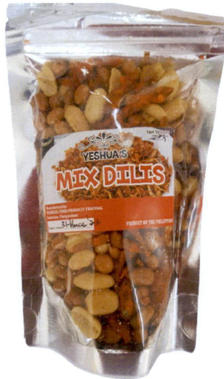
Figure 1. Unregistered YESHUA'S Mix Dilis

The Food and Drug Administration (FDA) warns all healthcare professionals and the general public NOT TO PURCHASE AND CONSUME the unregistered food product: