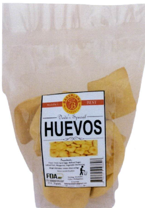
Figure 1. Unregistered MEDELLIN'S BEST DODO'S SPECIAL Huevos

The Food and Drug Administration (FDA) warns all healthcare professionals and the general public NOT TO PURCHASE AND CONSUME the unregistered food product: