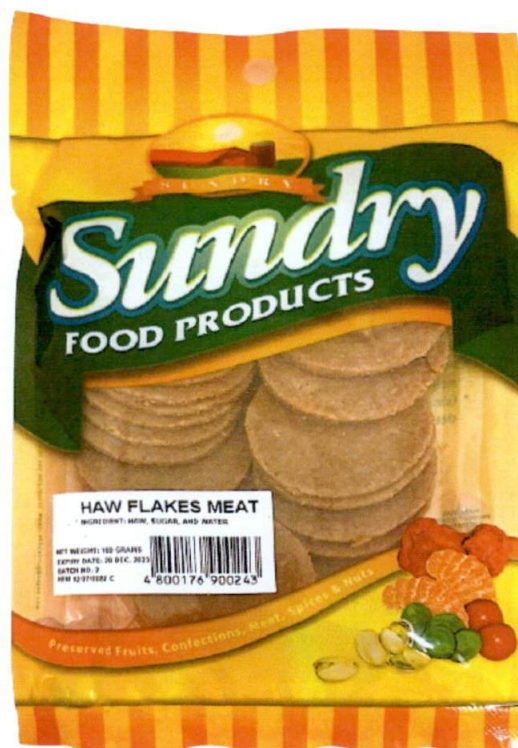
Figure 1. Unregistered SUNDRY FOOD PRODUCTS Haw Flakes Meat

The Food and Drug Administration (FDA) warns all healthcare professionals and the general public NOT TO PURCHASE AND CONSUME the unregistered food product: