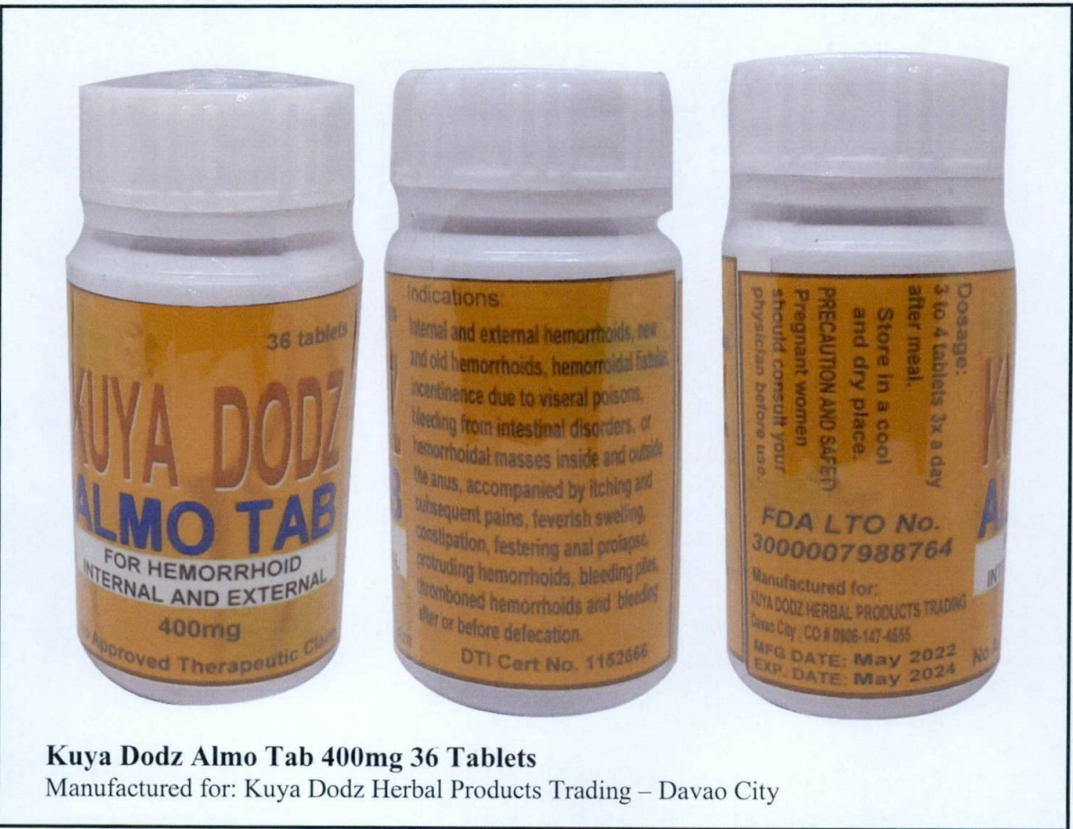
Kuya Dodz Almo Tab 400mg 36 Tablets Manufactured for: Kuya Dodz Herbal Products Trading – Davao City