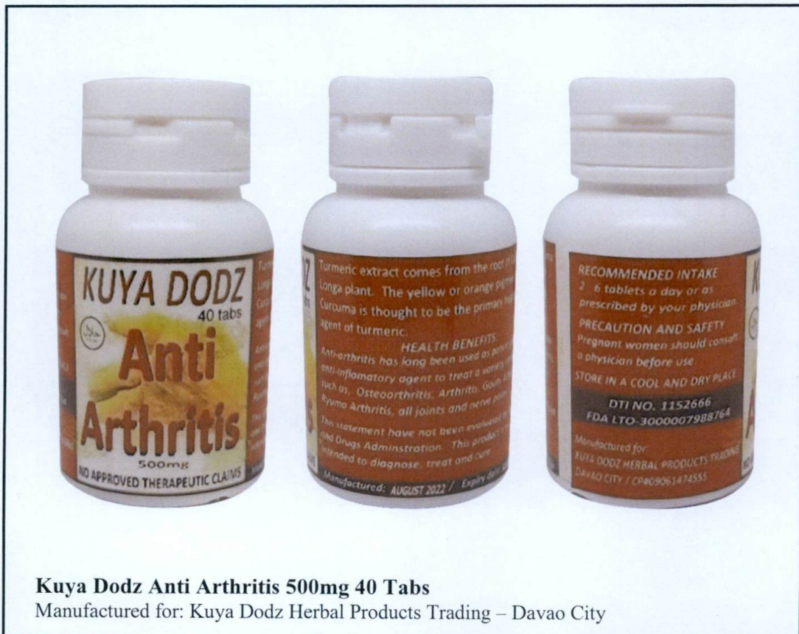
Kuya Dodz Anti Arthritis 500mg 40 Tabs

The Food and Drug Administration (FDA) advises the public against the purchase and use of the following unregistered drug products: