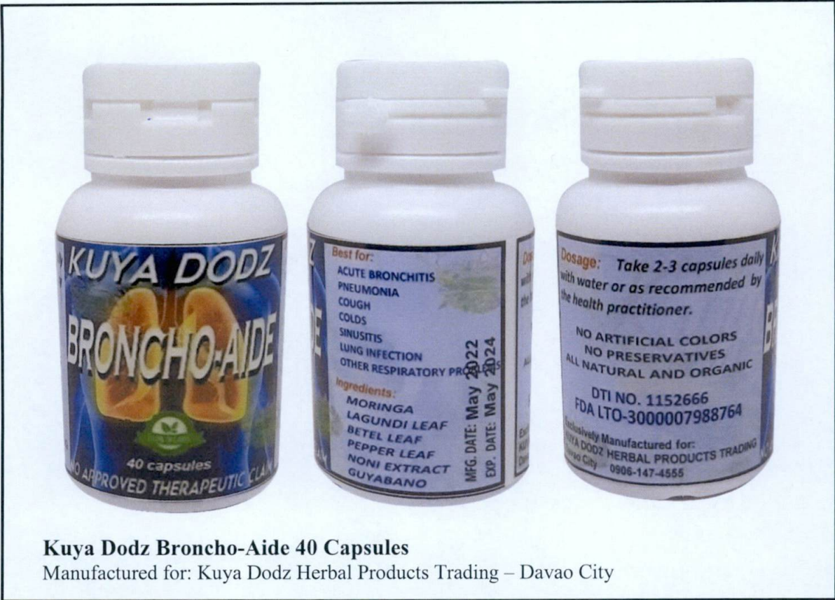
Kuya Dodz Broncho-Aide 40 Capsules Manufactured for: Kuya Dodz Herbal Products Trading – Davao City