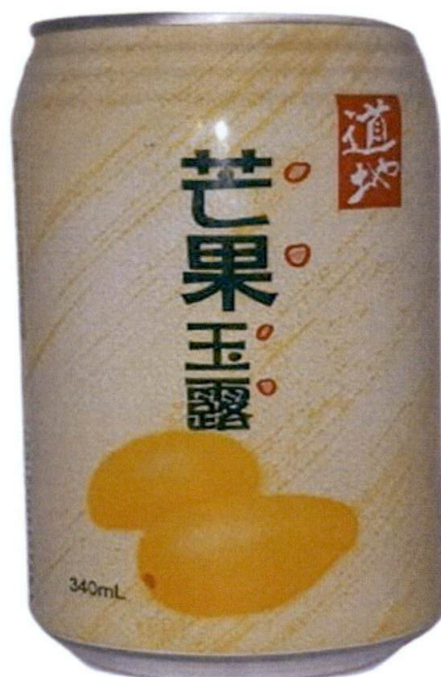
Figure 1. Unregistered TAO TI Mango Juice Drink (with Nata De Coco)

The Food and Drug Administration (FDA) warns all healthcare professionals and the general public NOT TO PURCHASE AND CONSUME the unregistered food product: