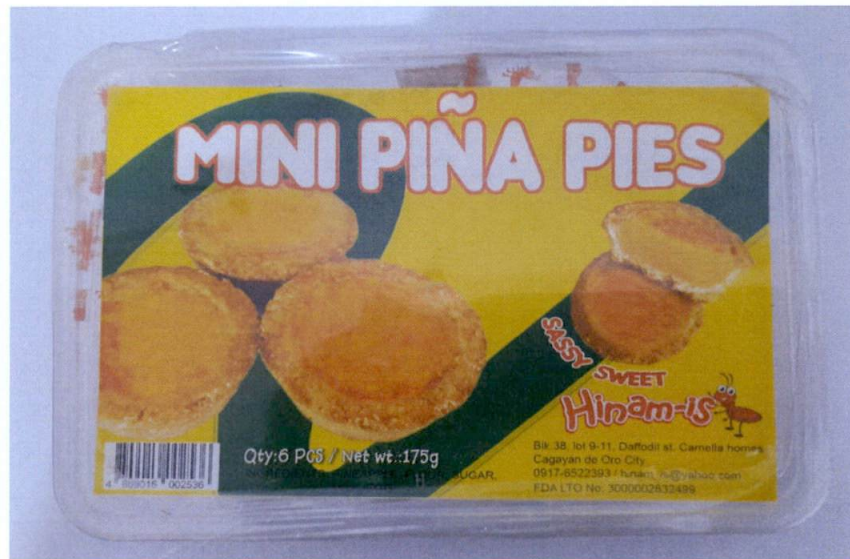
Figure 1. Unregistered HINAM-IS Mini Piña Pies

The Food and Drug Administration (FDA) warns all healthcare professionals and the general public NOT TO PURCHASE AND CONSUME the unregistered food product: