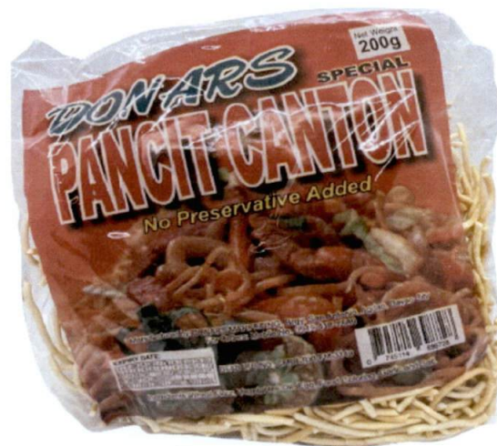
Figure 1. Unregistered DONARS Special Pancit Canton

The Food and Drug Administration (FDA) warns all healthcare professionals and the general public NOT TO PURCHASE AND CONSUME the unregistered food product: