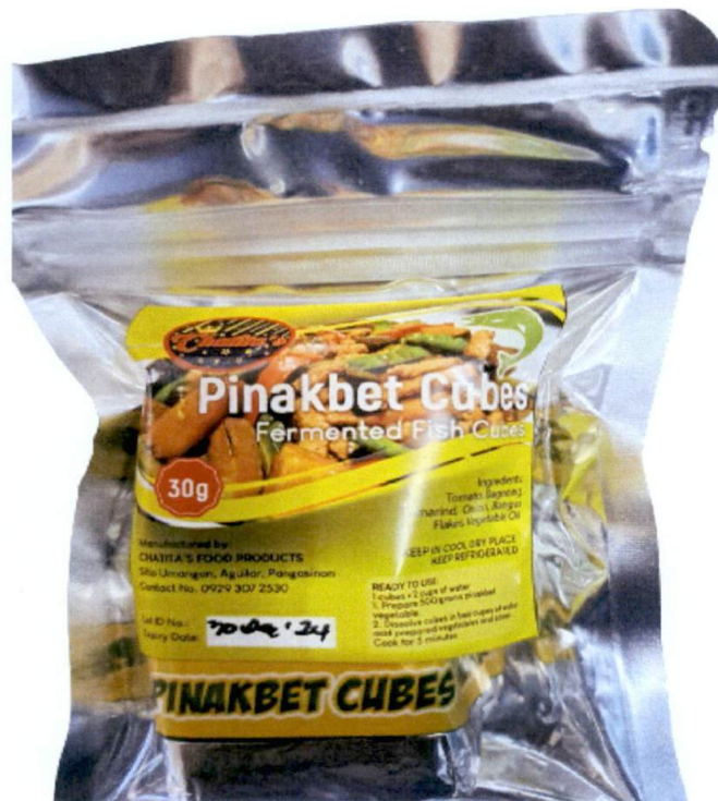
Figure 1. Unregistered CHATITA'S Pinakbet Cubes - Fermented Fish Cubes

The Food and Drug Administration (FDA) warns all healthcare professionals and the general public NOT TO PURCHASE AND CONSUME the unregistered food product: