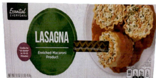
Figure 1. Unregistered ESSENTIAL EVERYDAY Lasagna Enriched Macaroni Product

The Food and Drug Administration (FDA) warns all healthcare professionals and the general public NOT TO PURCHASE AND CONSUME the unregistered food product: