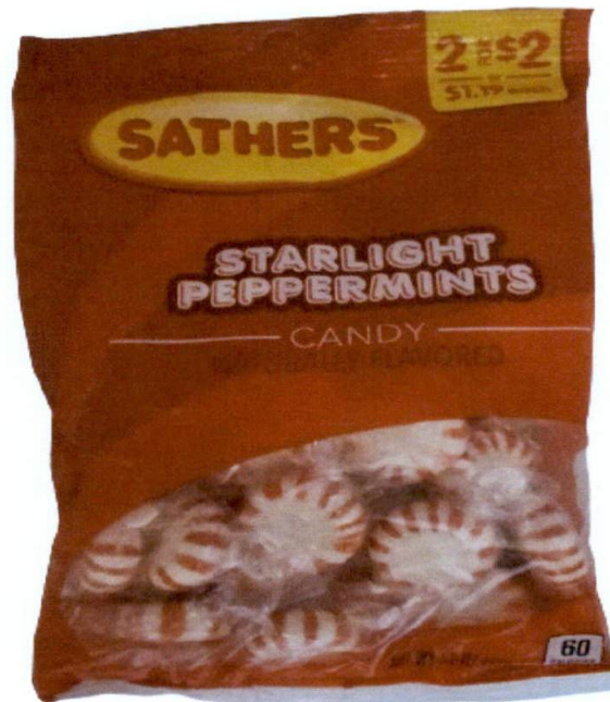
Figure 1. Unregistered SATHERS Starlight Peppermint Candy Naturally Flavored

The Food and Drug Administration (FDA) warns all healthcare professionals and the general public NOT TO PURCHASE AND CONSUME the unregistered food product: