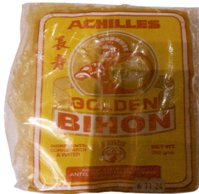
Figure 1. Unregistered ACHILLES Golden Bihon

The Food and Drug Administration (FDA) warns all healthcare professionals and the general public NOT TO PURCHASE AND CONSUME the unregistered food product: