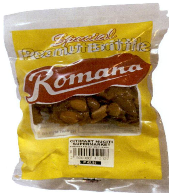
Figure 1. Unregistered ROMANA Special Brittle

The Food and Drug Administration (FDA) warns all healthcare professionals and the general public NOT TO PURCHASE AND CONSUME the unregistered food product: