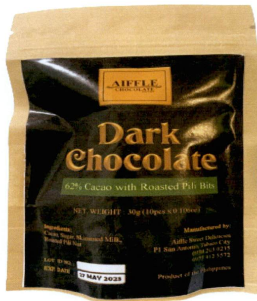
Figure 1. Unregistered AIFLE CHOCOLATE Dark Chocolate 62% Cacao with Roasted Pili Bits

The Food and Drug Administration (FDA) warns all healthcare professionals and the general public NOT TO PURCHASE AND CONSUME the unregistered food product: