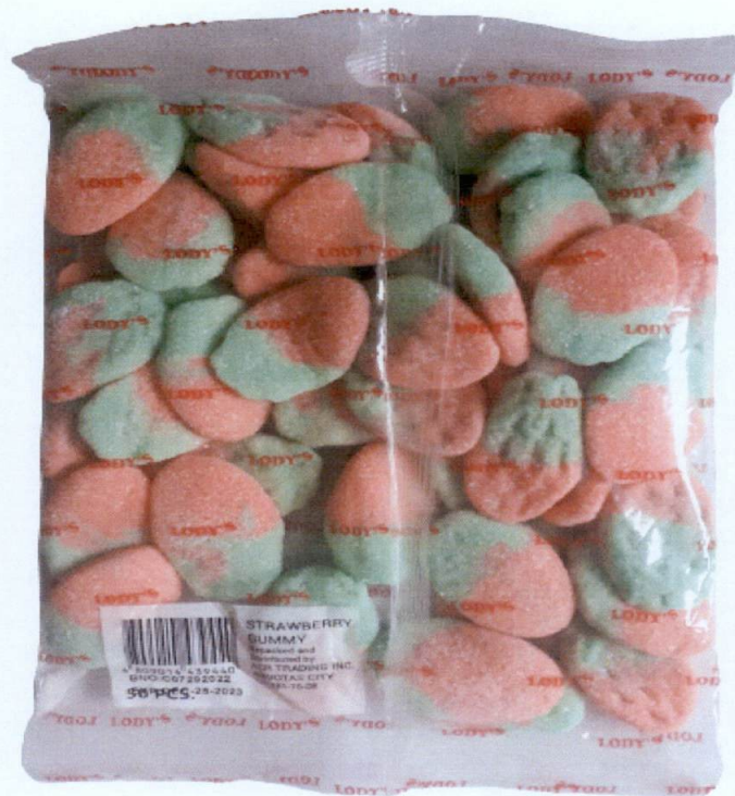
Figure 1. Unregistered LODY'S Strawberry Gummy

The FDA verified through online monitoring or post-marketing surveillance that the abovementioned food product is not registered and no corresponding Certificate of Product Registration (CPR) has been issued. Pursuant to the Republic Act No. 9711, otherwise known as the “Food and Drug Administration Act of 2009”, the manufacture, importation, exportation, sale, offering for sale, distribution, transfer, non-consumer use, promotion, advertising or sponsorship of health products without the proper authorization is prohibited.