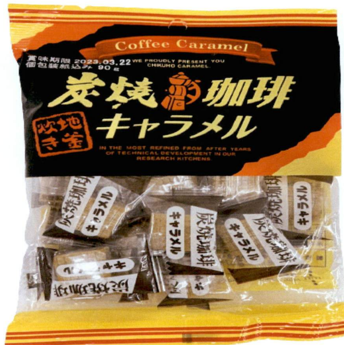
Figure 1. Unregistered CHIKUHO SEIKA Coffee Caramel

The Food and Drug Administration (FDA) warns all healthcare professionals and the general public NOT TO PURCHASE AND CONSUME the unregistered food product: