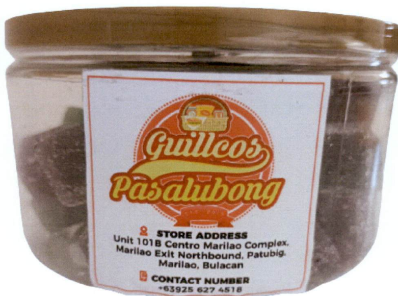
Figure 1. Unregistered GUILLCOS PASALUBONG Product in Transparent Container with Jelly Candy-like Product Inside

The Food and Drug Administration (FDA) warns all healthcare professionals and the general public NOT TO PURCHASE AND CONSUME the unregistered food product: