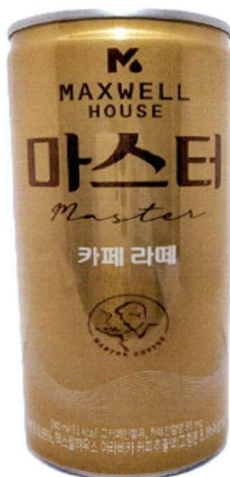
Figure 1. Unregistered MAXWELL HOUSE Master Coffee (In Foreign Language)

The Food and Drug Administration (FDA) warns all healthcare professionals and the general public NOT TO PURCHASE AND CONSUME the unregistered food product: