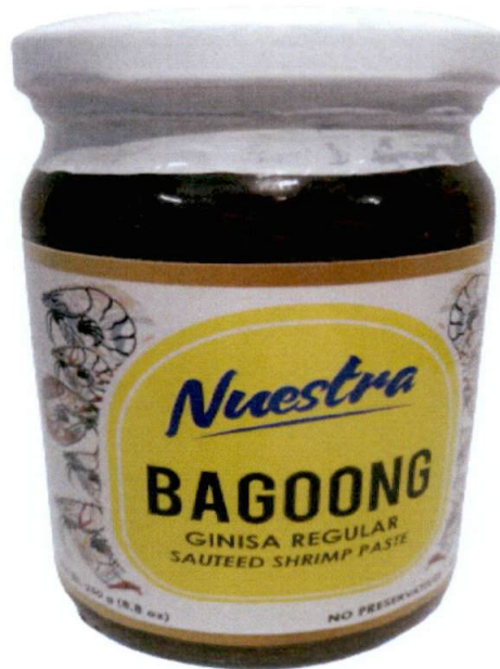
Figure 1. Unregistered NUESTRA Bagoong Ginisa Regular -Sautéed Shrimp Paste

The Food and Drug Administration (FDA) warns all healthcare professionals and the general public NOT TO PURCHASE AND CONSUME the unregistered food product: