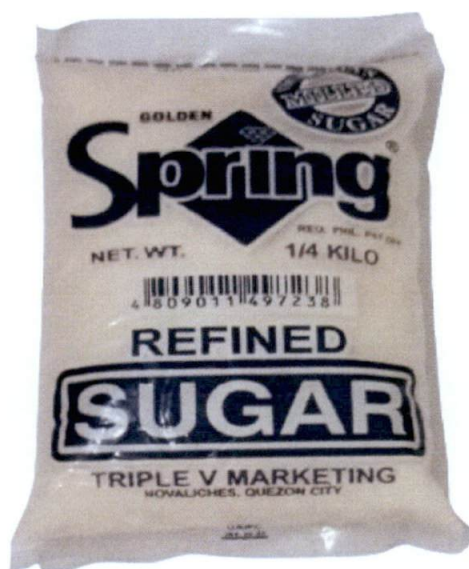
Figure 1. Unregistered GOLDEN SPRING Refined Sugar

The Food and Drug Administration (FDA) warns all healthcare professionals and the general public NOT TO PURCHASE AND CONSUME the unregistered food product: