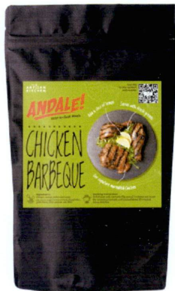
Figure 1. Unregistered THE ARTISAN KITCHEN ANDALE Chicken Barbeque

The Food and Drug Administration (FDA) warns all healthcare professionals and the general public NOT TO PURCHASE AND CONSUME the unregistered food product: