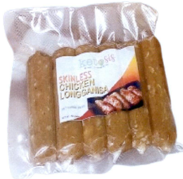
Figure 1. Unregistered KETO SIS Skinless Chicken Longganisa

The Food and Drug Administration (FDA) warns all healthcare professionals and the general public NOT TO PURCHASE AND CONSUME the unregistered food product: