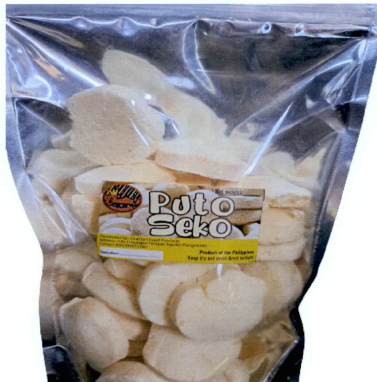
Figure 1. Unregistered CHATITA'S FOOD PRODUCTS Puto Seko

The Food and Drug Administration (FDA) warns all healthcare professionals and the general public NOT TO PURCHASE AND CONSUME the unregistered food product: