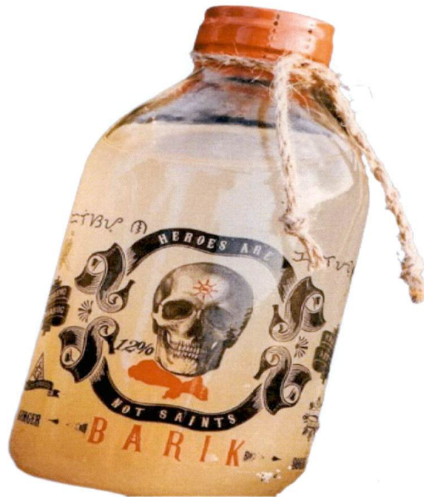
Figure 1. Unregistered HEROES ARE NOT SAINTS BARIK Ginger Sour

The Food and Drug Administration (FDA) warns all healthcare professionals and the general public NOT TO PURCHASE AND CONSUME the unregistered food product: