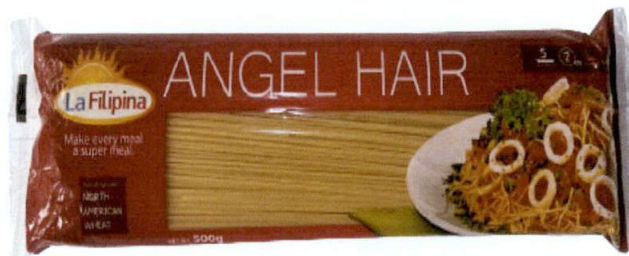
Figure 1. Unregistered LA FILIPINA Angel Hair

The Food and Drug Administration (FDA) warns all healthcare professionals and the general public NOT TO PURCHASE AND CONSUME the unregistered food product: