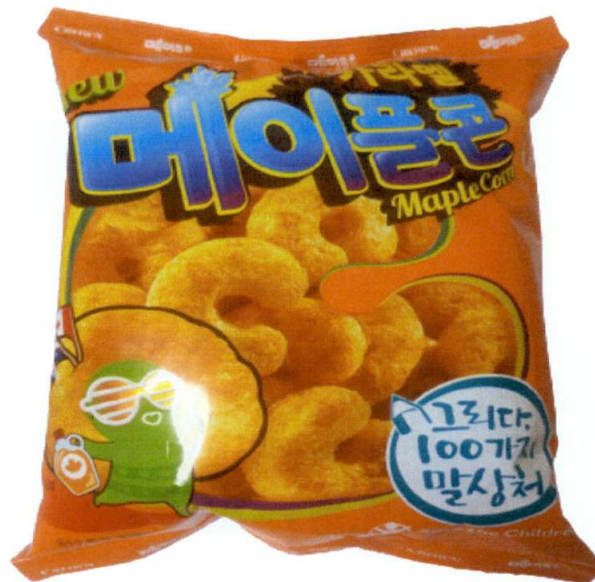
Figure 1. Unregistered CROWN Maple Corn in Orange Packaging (In Foreign Language)

The Food and Drug Administration (FDA) warns all healthcare professionals and the general public NOT TO PURCHASE AND CONSUME the unregistered food product: