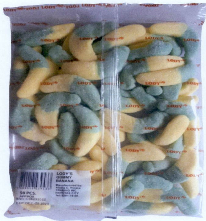
Figure 1. Unregistered LODY'S Gummy Banana

The FDA verified through online monitoring or post-marketing surveillance that the abovementioned food product is not registered and no corresponding Certificate of Product Registration (CPR) has been issued. Pursuant to the Republic Act No. 9711, otherwise known as the “Food and Drug Administration Act of 2009”, the manufacture, importation, exportation, sale, offering for sale, distribution, transfer, non-consumer use, promotion, advertising or sponsorship of health products without the proper authorization is prohibited.