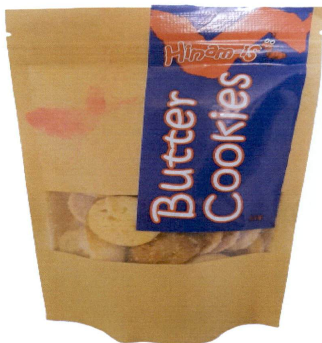
Figure 1. Unregistered HINAM-IS Butter Cookies

The Food and Drug Administration (FDA) warns all healthcare professionals and the general public NOT TO PURCHASE AND CONSUME the unregistered food product: