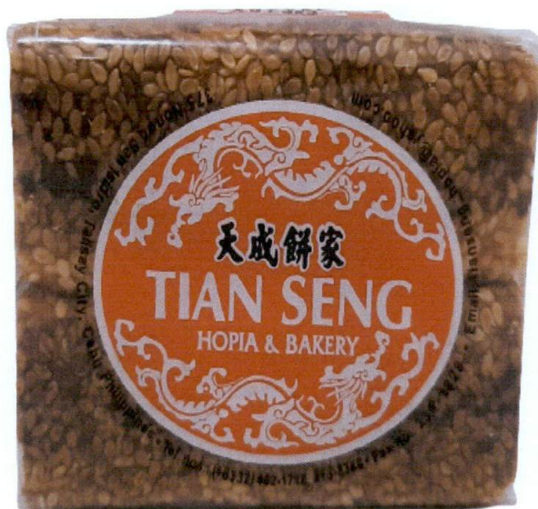
Figure 1. Unregistered TIAN SENG HOPIA & BAKERY Sesame Cake

The Food and Drug Administration (FDA) warns all healthcare professionals and the general public NOT TO PURCHASE AND CONSUME the unregistered food product: