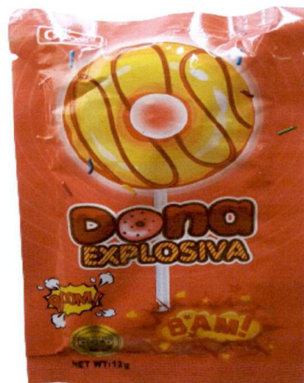
Figure 1. Unregistered COCO FALL IN LOVE WITH Dona Explosiva

The Food and Drug Administration (FDA) warns all healthcare professionals and the general public NOT TO PURCHASE AND CONSUME the unregistered food product: