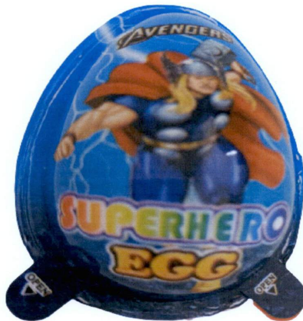
Figure 1. Unregistered (UNBRANDED) Superhero Egg - Avengers

The Food and Drug Administration (FDA) warns all healthcare professionals and the general public NOT TO PURCHASE AND CONSUME the unregistered food product: