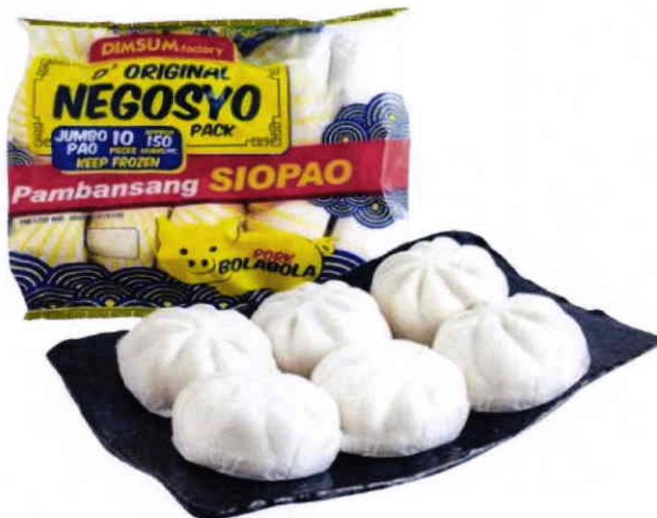
Figure 1. Unregistered DIMSUM FACTORY Pambansang Siopao Pork Bola Bola

The FDA verified through online monitoring or post-marketing surveillance that the abovementioned food product is not registered and no corresponding Certificate of Product Registration (CPR) has been issued. Pursuant to the Republic Act No. 9711, otherwise known as the “Food and Drug Administration Act of 2009”, the manufacture, importation, exportation, sale, offering for sale, distribution, transfer, non-consumer use, promotion, advertising or sponsorship of health products without the proper authorization is prohibited.