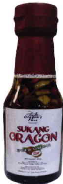
Figure 1. Unregistered ORAGON'S FAVE Sukang Oragon Spiced Vinegar

The Food and Drug Administration (FDA) warns all healthcare professionals and the general public NOT TO PURCHASE AND CONSUME the unregistered food product: