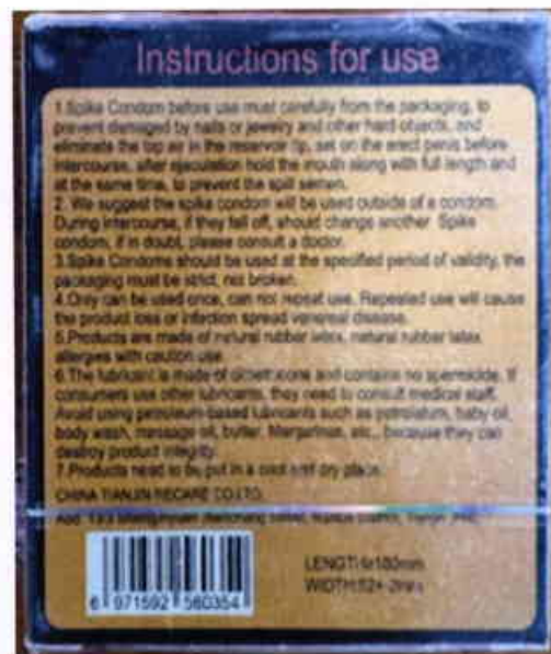
Figure 3. Unregistered Recare® Monster Different Condom