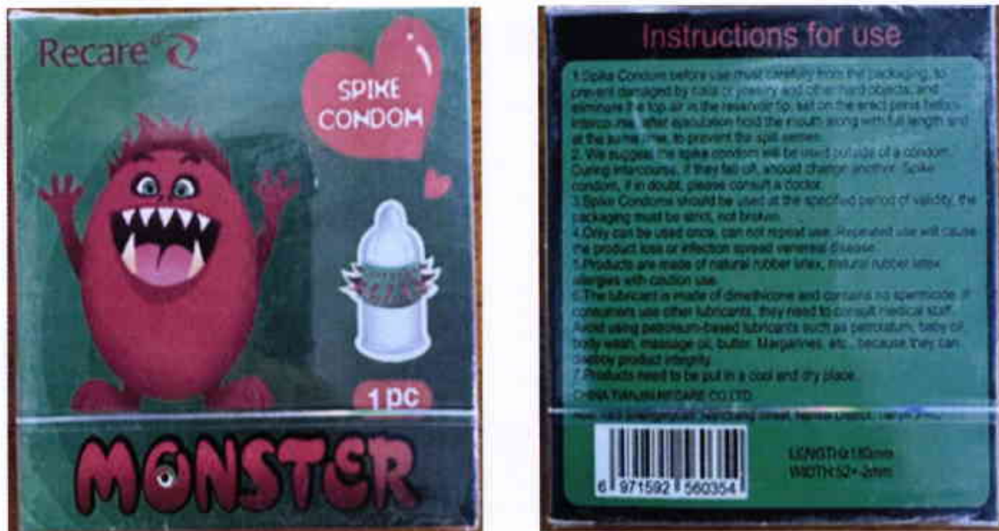
Figure 1. Unregistered Recare® Monster Spike Condom

The Food and Drug Administration (FDA) warns all healthcare professionals and the general public NOT TO PURCHASE AND USE the following unregistered medical device products: