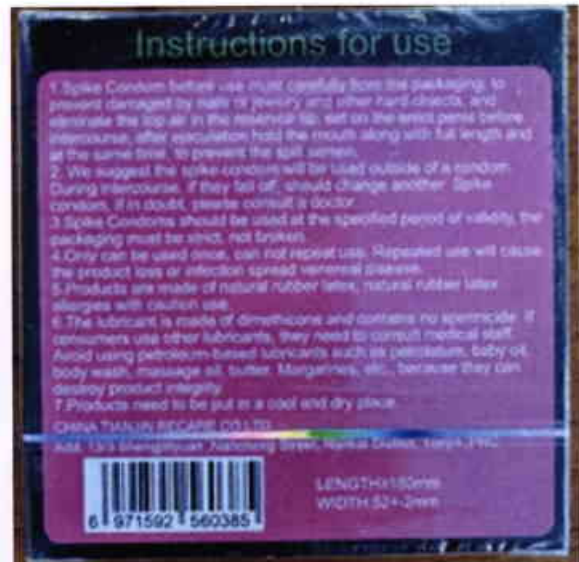
Figure 2. Unregistered Recare® Monster Interesting Condom