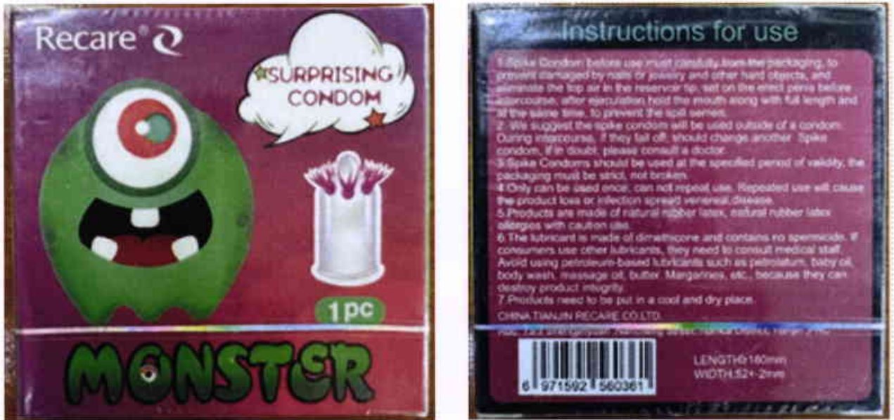
Figure 4. Unregistered Recare® Monster Surprising Condom

The FDA verified through post-marketing surveillance that the above-mentioned medical device products are not registered, and no corresponding Product Registration Certificates have been issued. Pursuant to the Republic Act No. 9711, otherwise known as the “Food and Drug Administration Act of 2009”, the manufacture, importation, exportation, sale, offering for sale, distribution, transfer, non-consumer use, promotion, advertising, or sponsorship of health products without the proper authorization is prohibited.