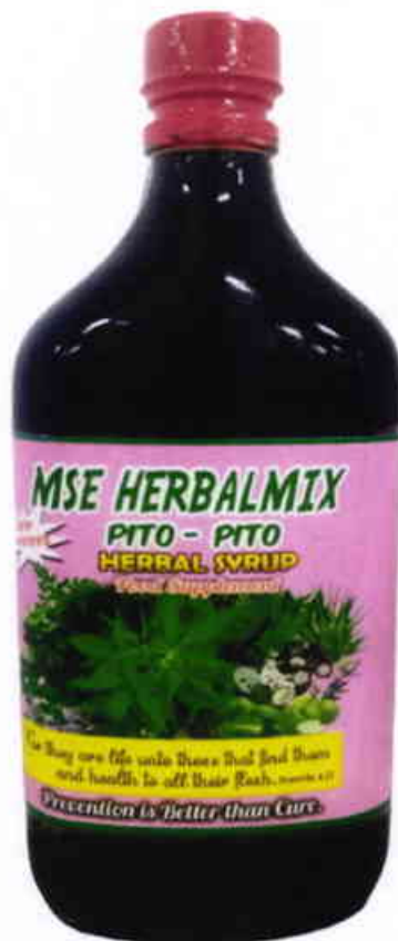
Figure 3. Unregistered MSE HERBAL MIX Pito-Pito Herbal Syrup Food Supplement