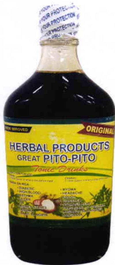
Figure 2. Unregistered HERBAL PRODUCTS GREAT Pito-Pito Tonic Drinks