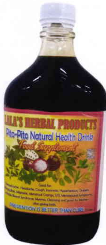
Figure 4. Unregistered LALA'S HERBAL PRODUCTS Pito-Pito Natural Health Drink Food Supplement

The FDA verified through online monitoring or post-marketing surveillance that the abovementioned food supplements are not registered and no corresponding Certificates of Product Registration (CPR) have been issued. Pursuant to the Republic Act No. 9711, otherwise known as the "Food and Drug Administration Act of 2009", the manufacture, importation, exportation, sale, offering for sale, distribution, transfer, non-consumer use, promotion, advertising or sponsorship of health products without the proper authorization is prohibited.