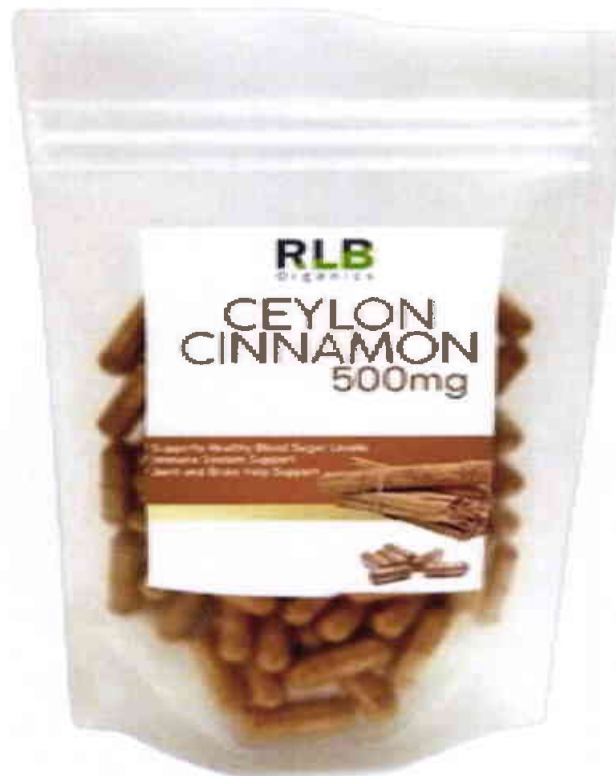
Figure 1. Unregistered RLB ORGANICS Ceylon Cinnamon

The FDA verified through online monitoring or post-marketing surveillance that the abovementioned food product is not registered and no corresponding Certificate of Product Registration (CPR) has been issued. Pursuant to the Republic Act No. 9711, otherwise known as the “Food and Drug Administration Act of 2009”, the manufacture, importation, exportation, sale, offering for sale, distribution, transfer, non-consumer use, promotion, advertising or sponsorship of health products without the proper authorization is prohibited.