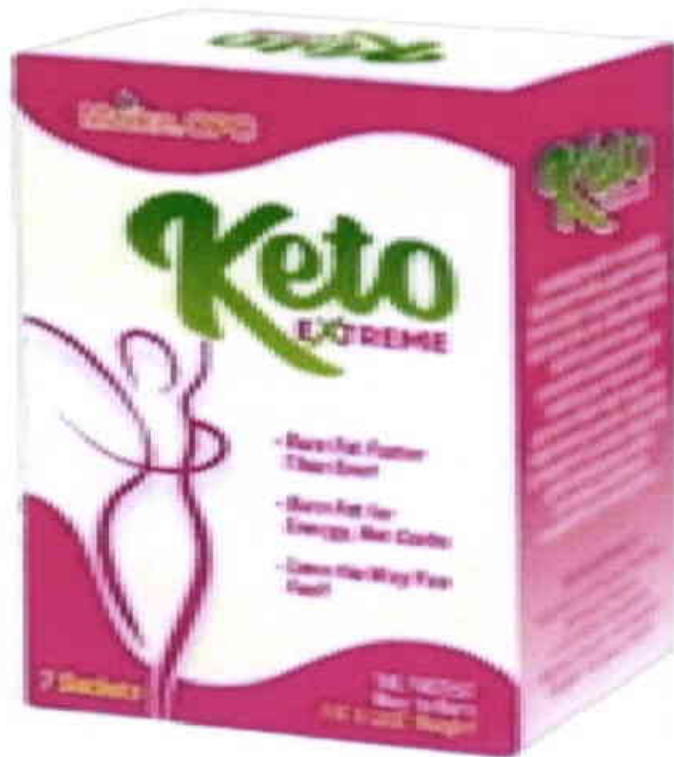
Figure 1. Unregistered KETO EXTREME Mixed Berries Juice Drink

The FDA verified through online monitoring or post-marketing surveillance that the abovementioned food product is not registered and no corresponding Certificate of Product Registration (CPR) has been issued. Pursuant to the Republic Act No. 9711, otherwise known as the “Food and Drug Administration Act of 2009”, the manufacture, importation, exportation, sale, offering for sale, distribution, transfer, non-consumer use, promotion, advertising or sponsorship of health products without the proper authorization is prohibited.