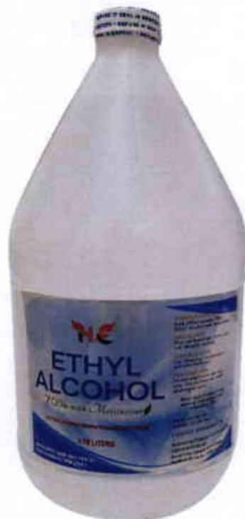
Figure 2. Unregistered and adulterated drug product

Manufactured and Distributed by: Hanzel'Ernie Consumer Goods Trading - San Martin III, San Jose Del Monte, Bulacan