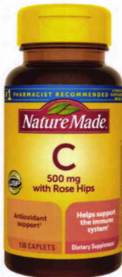
Figure 1. Unregistered NATUREMADE C 500mg with Rosehips Dietary Supplement

The Food and Drug Administration (FDA) warns all healthcare professionals and the general public NOT TO PURCHASE AND CONSUME the following unregistered food supplements: