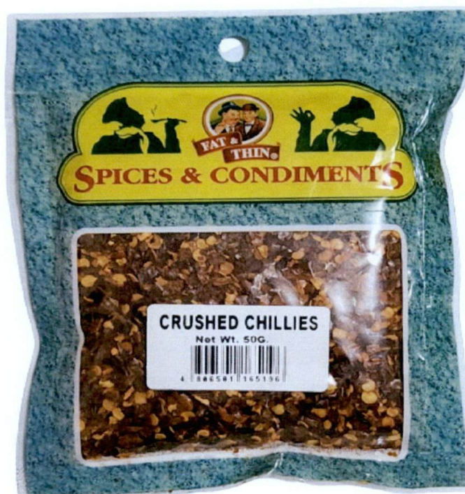
Figure 1. Unregistered FAT & THIN SPICES & CONDIMENTS Crushed Chillies

The Food and Drug Administration (FDA) warns all healthcare professionals and the general public NOT TO PURCHASE AND CONSUME the unregistered food product: